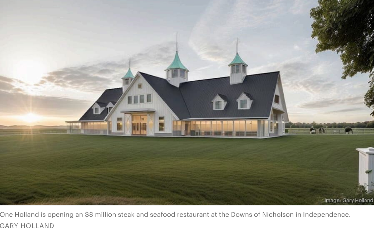
One Holland is opening an $8 million steak and seafood restaurant at the Downs of Nicholson in Independence. GARY HOLLAND